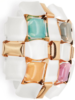
MIDA APPLIQUE - MULTICOLOR